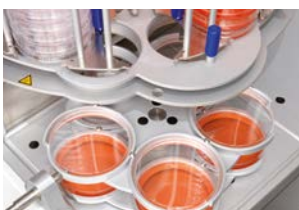
Systec Mediafill with Petri dishes