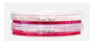
labelling on the sides of Petri dishes