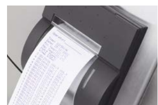
Systec Mediaprep printer for documentation