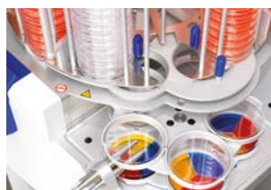
Systec Mediafill with Tri-Plates